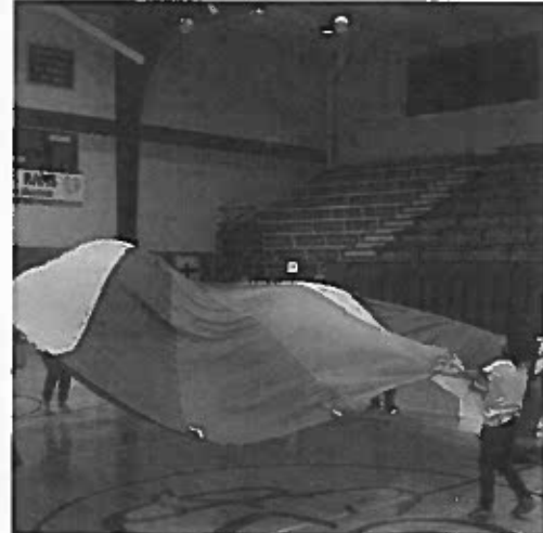
Students in Physical Education enjoy many different activities!