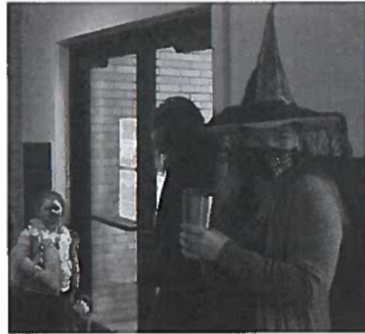
There were many interesting outfits for our Halloween celebrations.