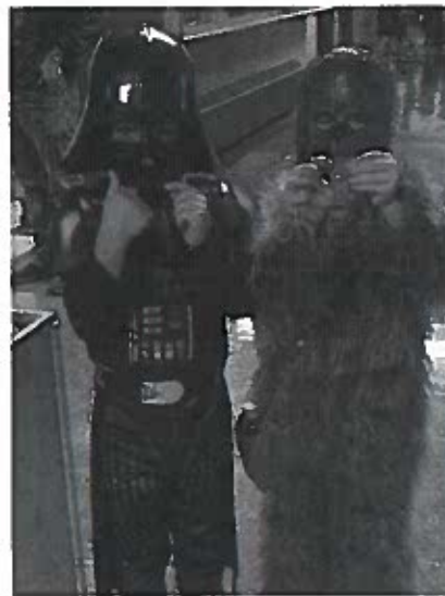
The Fall Harvest Fest was a huge success. Thanks to all who contributed and participated.