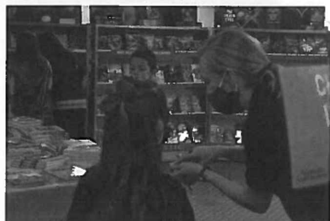
The students were Happy Campers selecting books and supplies at the book fair.