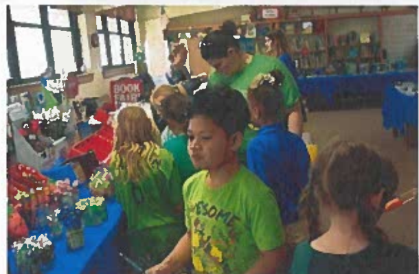
Looking at different items at the Book Fair.