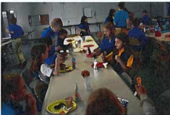
Students enjoying their AR party.