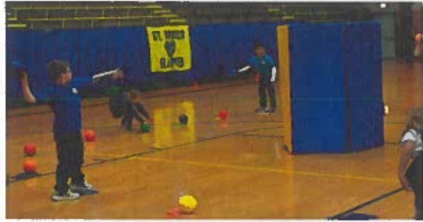
2nd grade playing Duck Hunt.