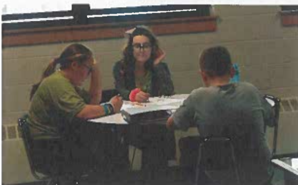
Concentrating during study time.