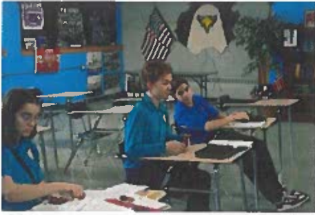
Current events students discussing recent events.