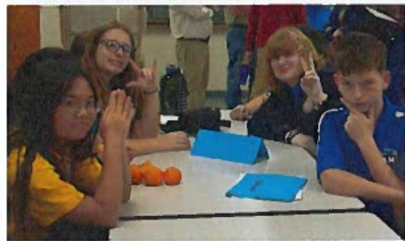
MS Scholars Bowl preparing for a round.