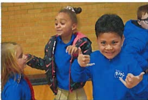
1st grade hanging out!