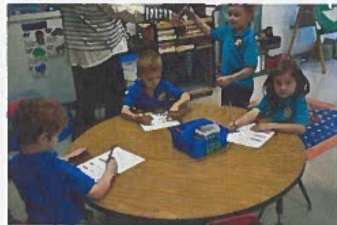
Having fun while learning!