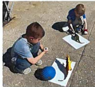
Drawing Pictures with Shadows!