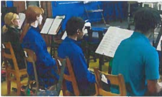
Band preparing for their concert.