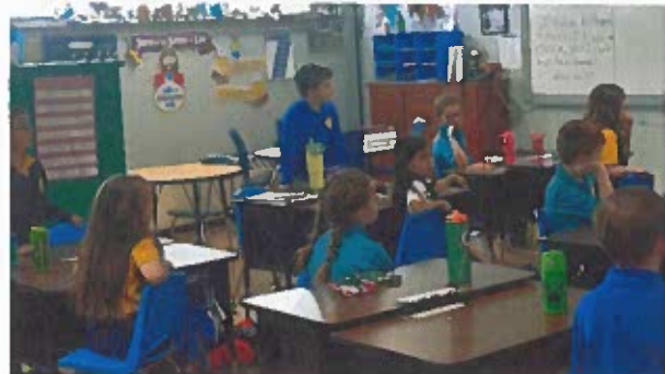
Enjoying a movie.

FBLA at the Junction City Opera House—a great field trip.