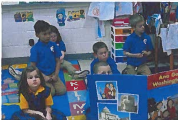
My favorite time--reading time!