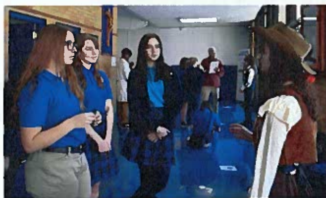
The 8th grade visits 10th Grade Wax Museum.