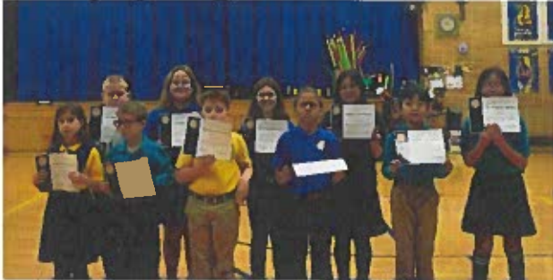
Students celebrating their accomplishments.