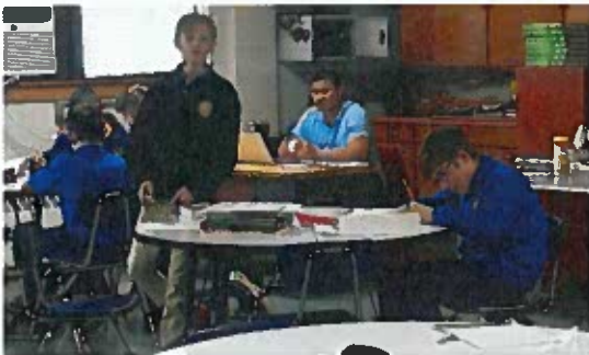
6 th grade busy at work.