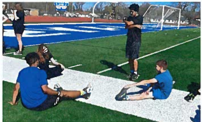
The Saint Xavier track team warming up.