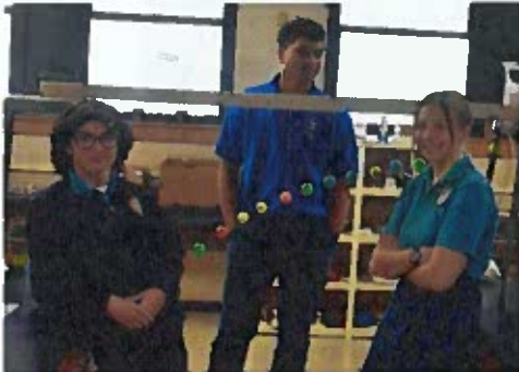
The Juniors are proud of their Controlled Chaos Pendulum!