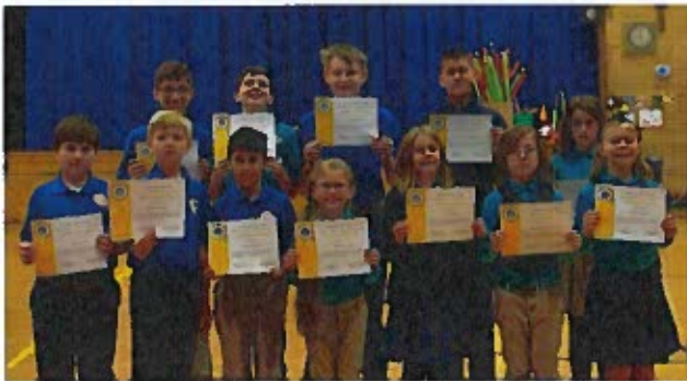
Students receiving gold honor roll awards.