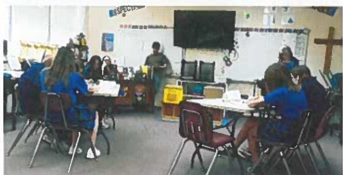
MS Scholars Bowl team at a meet.

EDUCATING FOR ETERNITY THROUGH FAITH & REASON