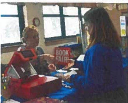
Making a book fair purchase.