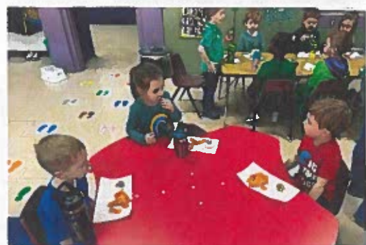
It's SNACK TIME!