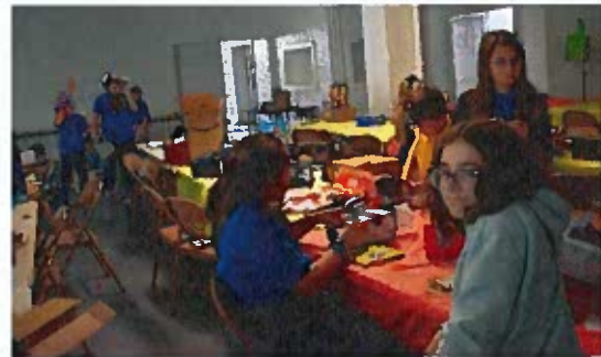
AR party kids being creative!