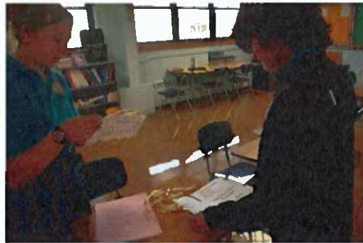
11th grade working on a science project!