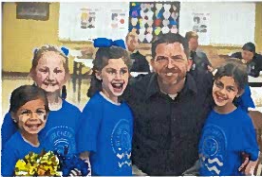
Mr A. posing for a picture with cheer clinic kids.