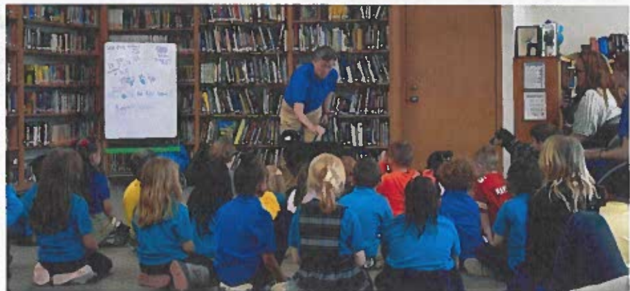
Students learning about search dogs.