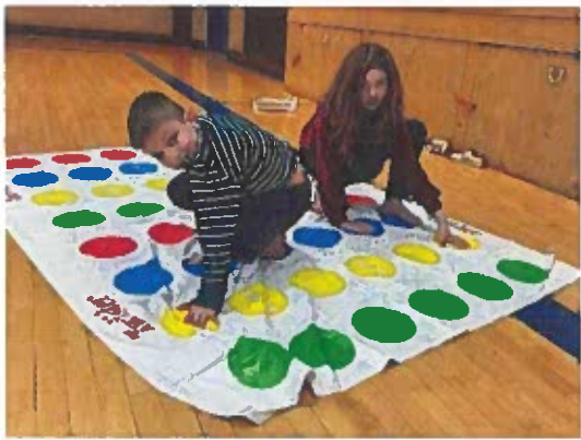
Kids playing Twister.