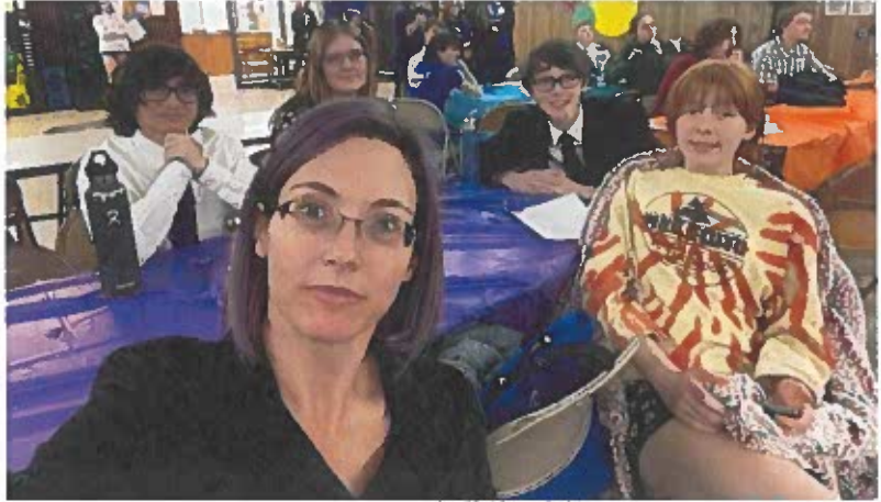
The St. X Forensics Team all made it to Finals!