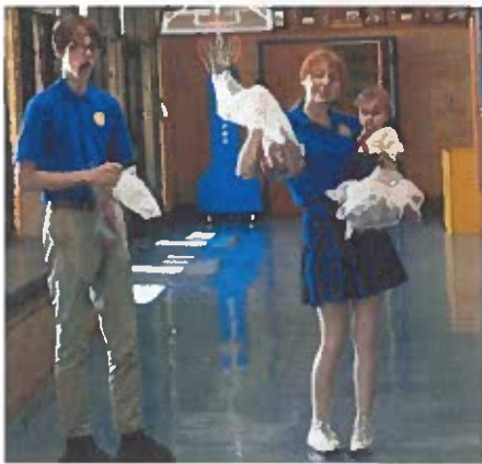
The St. X Ramily has members of all ages!