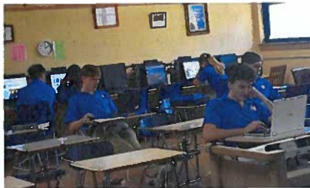
Yearbook students working on projects.