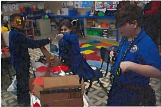
Enjoying their Mardi Gras party.