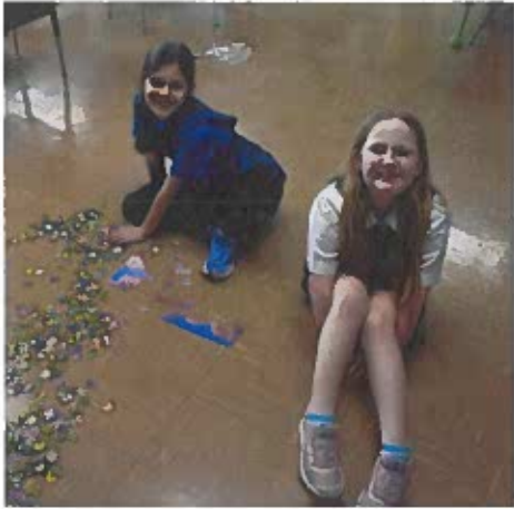
Starting on a puzzle!