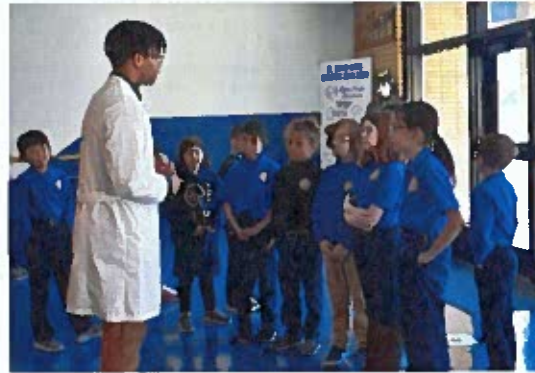
A presenter for the sophomore historic wax museum.