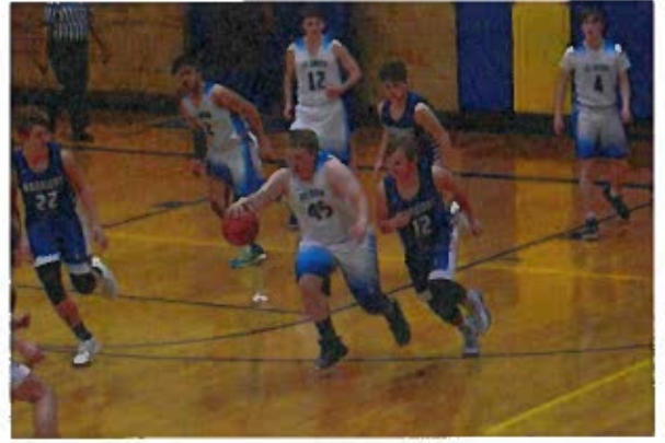
Rams dominating Peabody on their home turf.