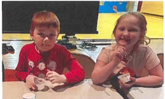
Eating ice cream at parents' night out.

EDUCATING FOR ETERNITY THROUGH FAITH & REASON