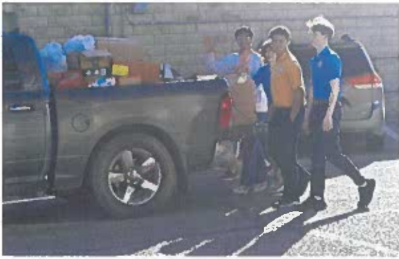
Heading to the Food Pantry with the St. X donations.