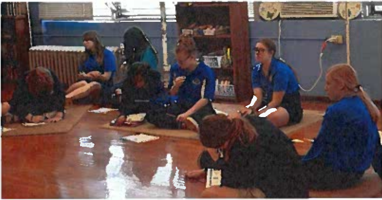
Band class listening to songs for their March Madness brackets.