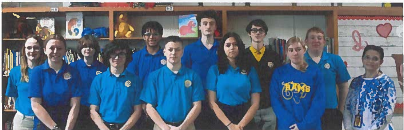
StuCo getting their group photo taken for the 2024 yearbook.