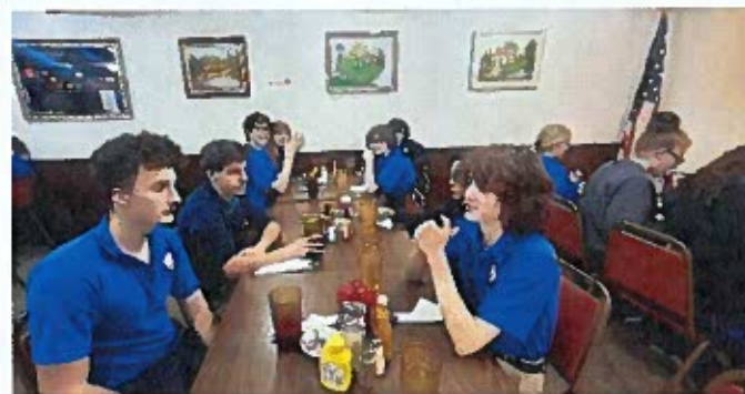
Having an FBLA business lunch at Stacy's.