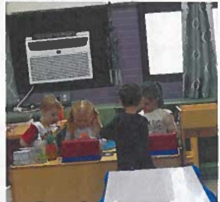
Preschoolers enjoying school!