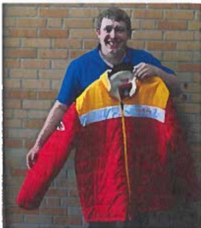
One of the auction items-- beautiful jacket--Go Chiefs.