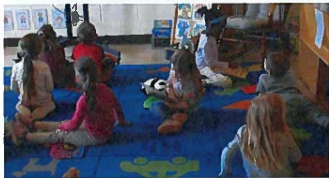
Loving their reading time.