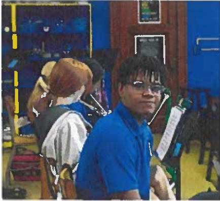
Students enjoying band.