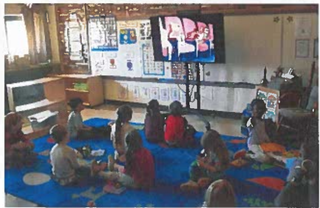
Pre-K enjoying watching Winnie the Pooh!