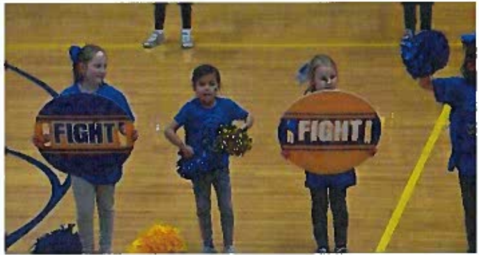
Cheer clinic Performance.