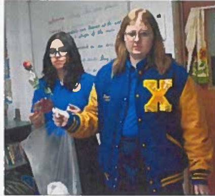
Students delivering candygrams.