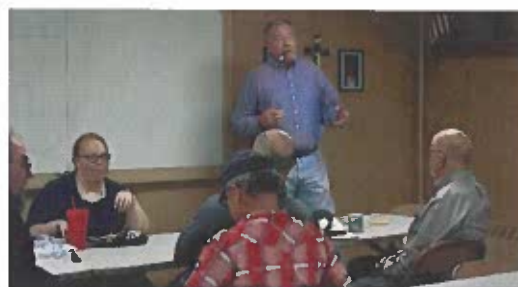
Knights of Columbus members enjoying lunch with the students.