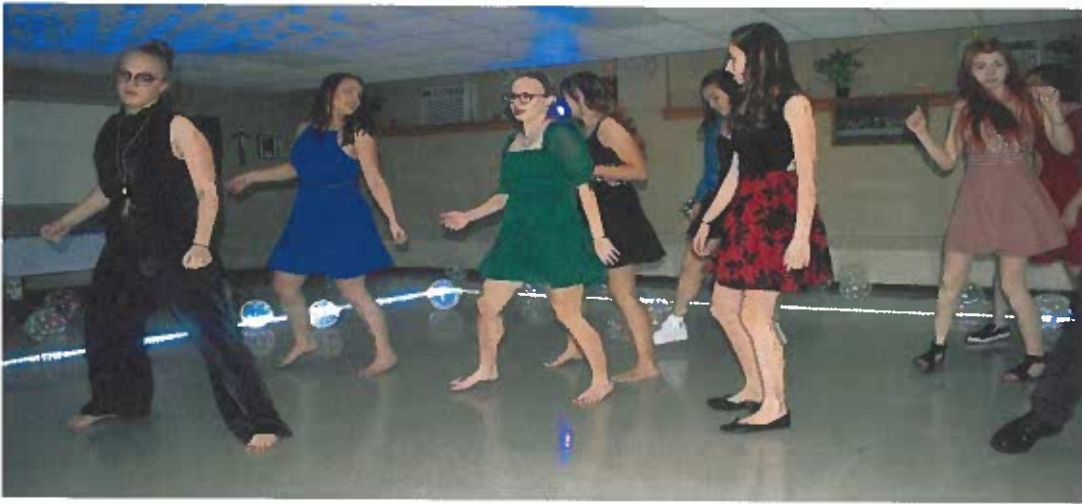
High school students enjoying the Homecoming Dance.