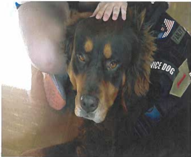
Saint X is visited by Farley, a service dog from the USO.