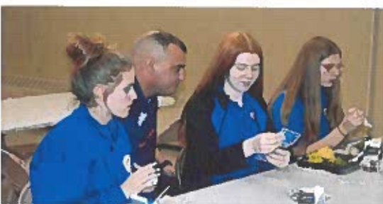
High schoolers having fun at lunch.