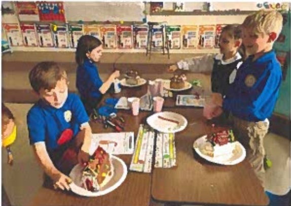
Students making gingerbread houses.