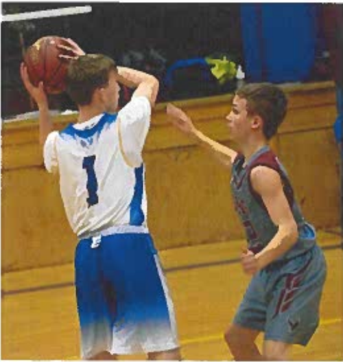
Middle school basketball boys team member playing hard.