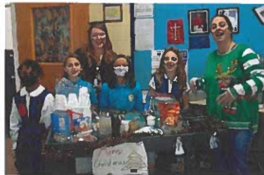
2 nd graders singing Christmas carols and serving treats to the teachers.