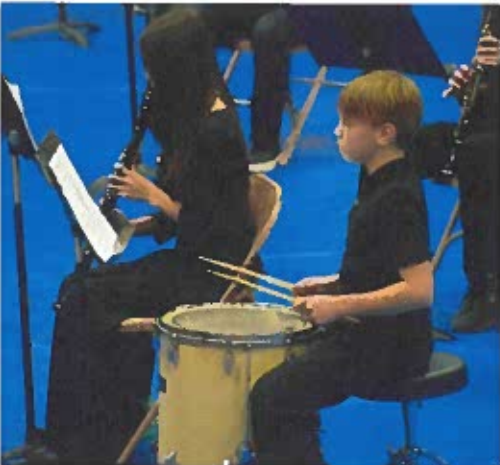
Band members playing at the Saint Xavier Christmas Concert.