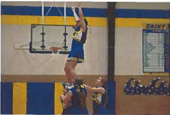
Cheerleaders practice a stunt.