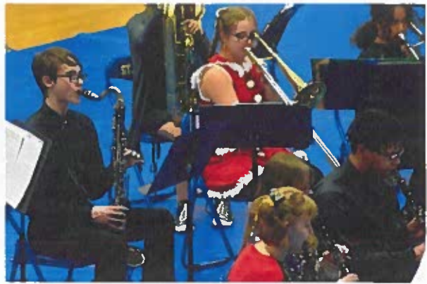
Love those Christmas songs!