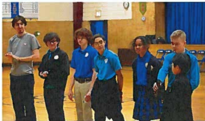
The chess club introduced.