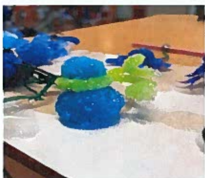
A crystal snowman made in chemistry class.