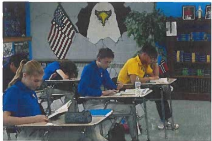
Sophomores doing work in history class.