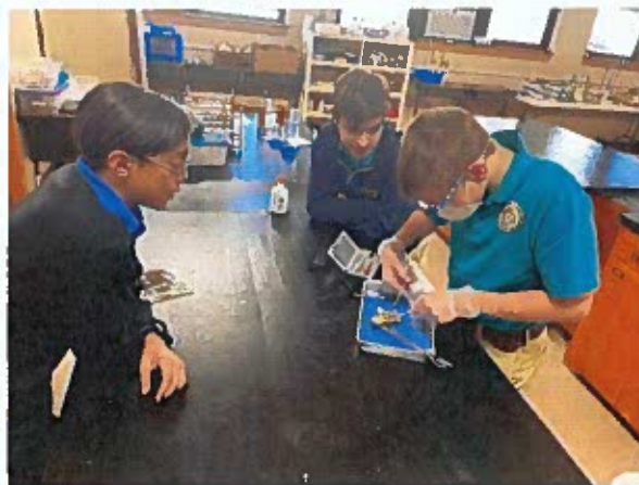
Biology class working on a dissection.