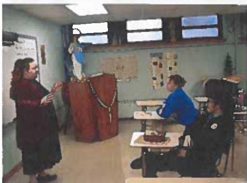
11th grade religion class.