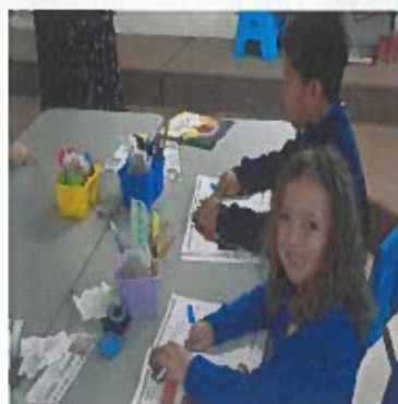
4th grade working hard.