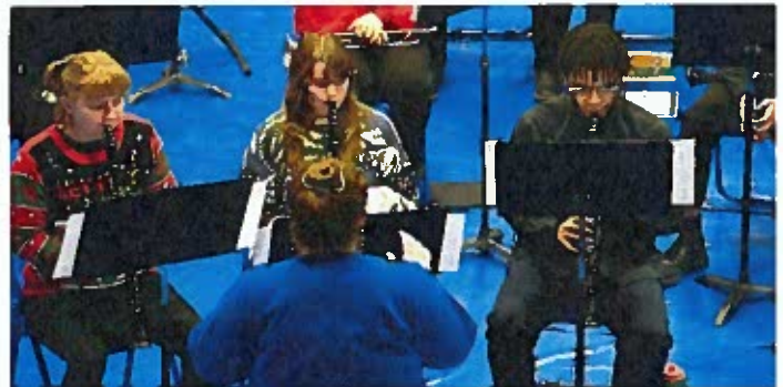
The clarinet section being featured.