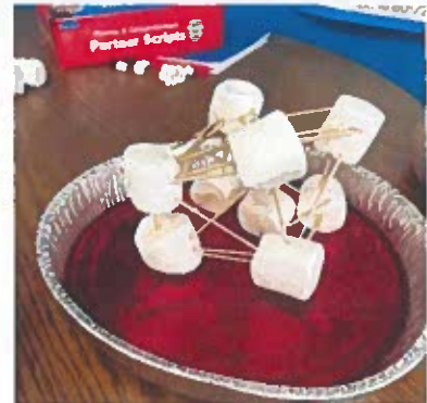
A marshmallow building-how well will it do in an earthquake.