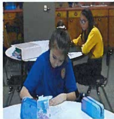
6th grade working independently.