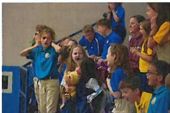
Students at the pep rally.