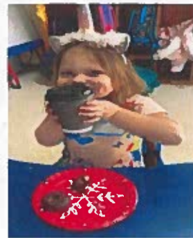
Having the perfect winter snack!