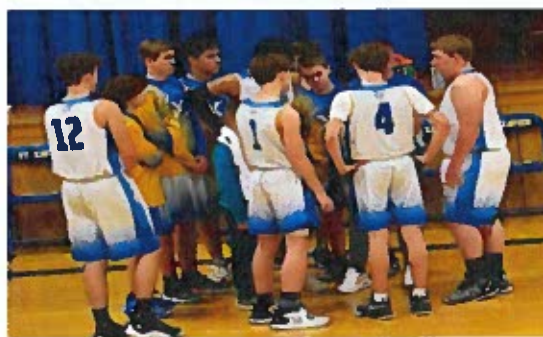
The HS boys basketball team going over strategy during a timeout.