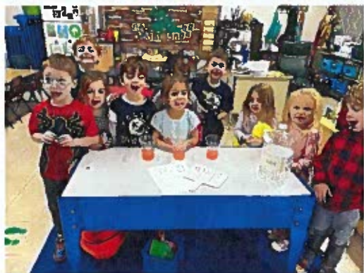
PreK dying water using candy canes. PreK Christmas party.