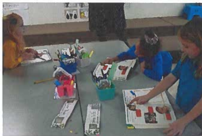
First graders diligently doing their classwork.

EDUCATING FOR ETERNITY THROUGH FAITH & REASON