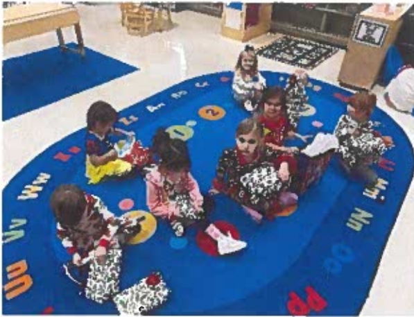
Preschoolers opening Christmas presents.