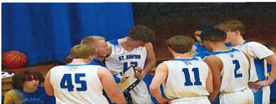
HS boys taking time out to work on the game plan.