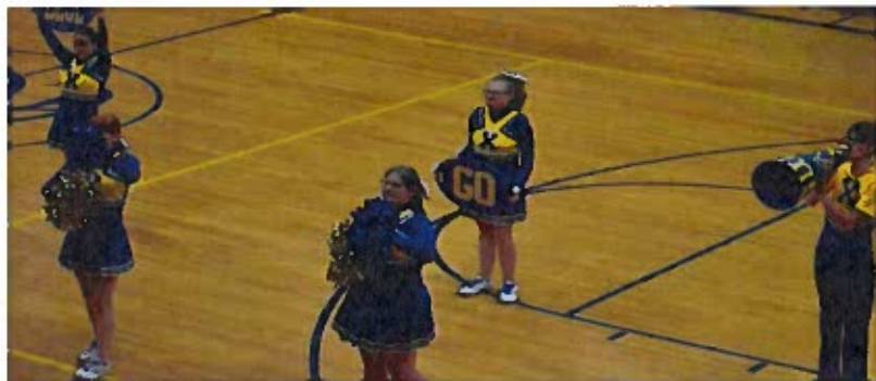
The high school cheerleaders at the pep rally.