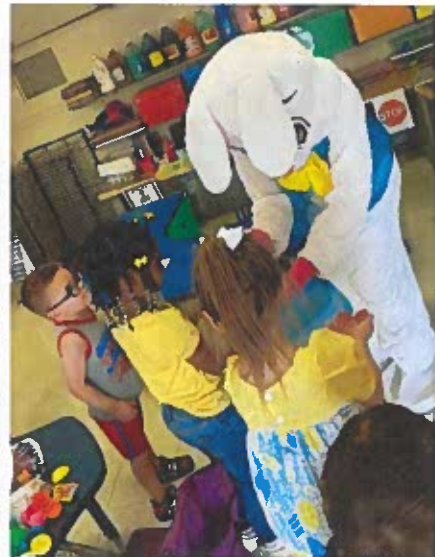
PreK was excited that the Easter Bunny visited them.