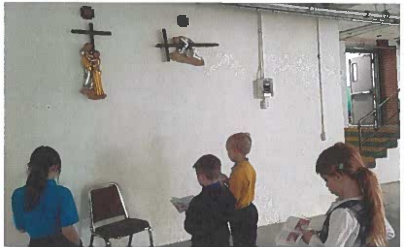
First grade walking the Way of the Cross.