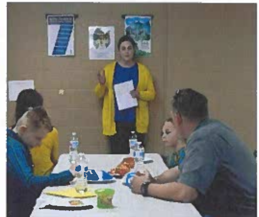
Guests at St. X Open House for prospective families.