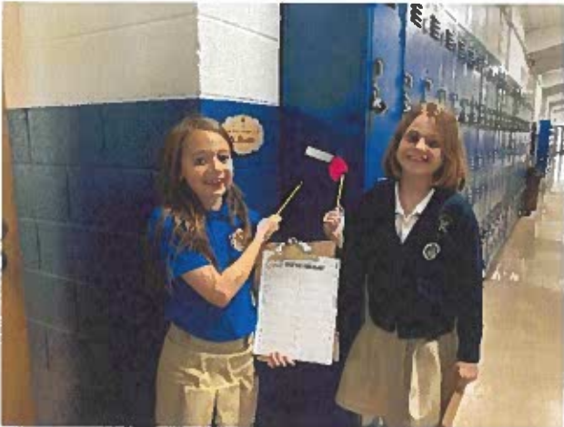
Third grade participating in their Easter Egg Hunt.