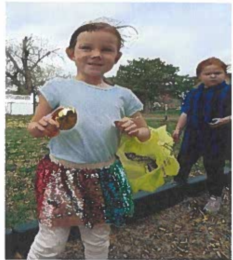
Preschooler finds golden Easter Egg.