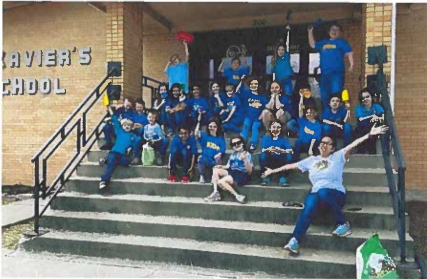
Grades 1 and 2 enjoyed their activities on Earth Day!! Thank you for beautifying our campus.