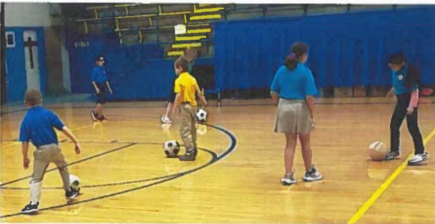
Students learning the basics of soccer in PE class.