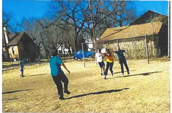
HS and MS enjoying a game of Ultimate Frisbee.