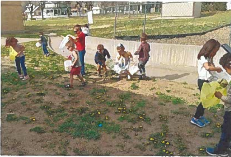
PreK students hunting for Easter eggs.