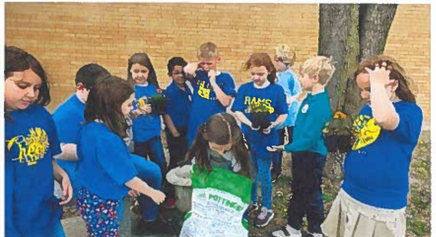
Grades 1 and 2 observed Earth Day by preparing the soil and planting flowers on the church and school grounds.