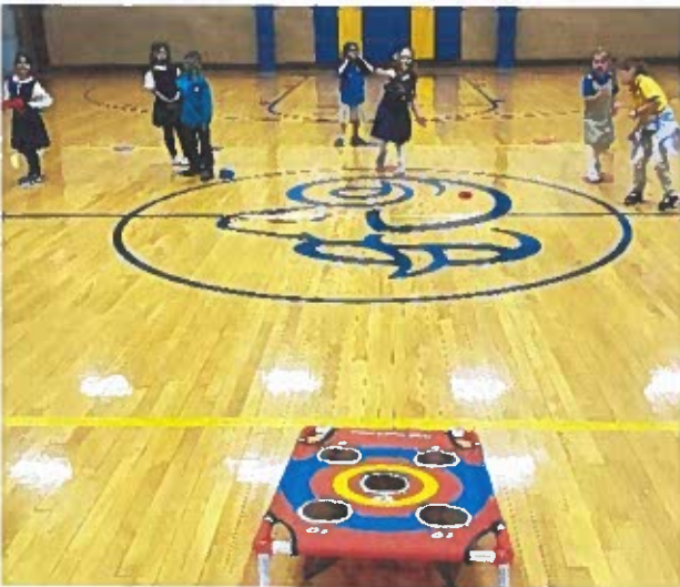
Kindergarten playing bag toss.