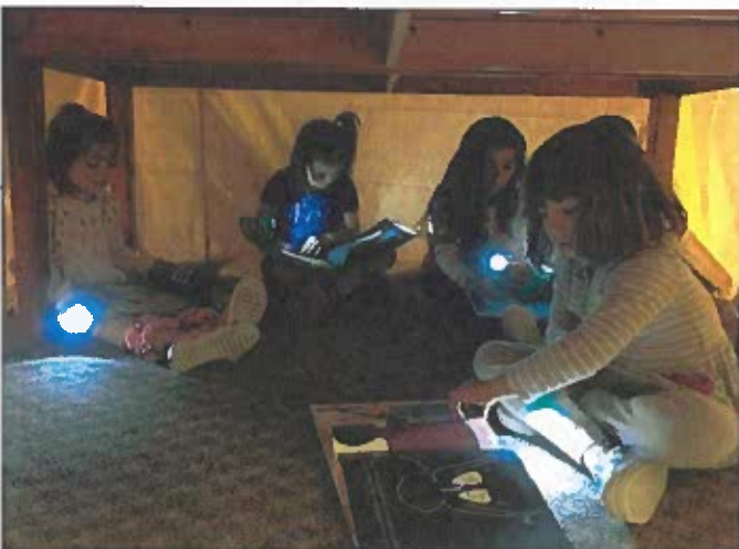
PreK students reading stories in a blanket fort.