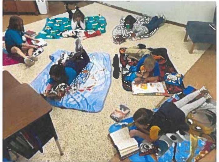
Comfortable Grade 2 students enjoying reading time.