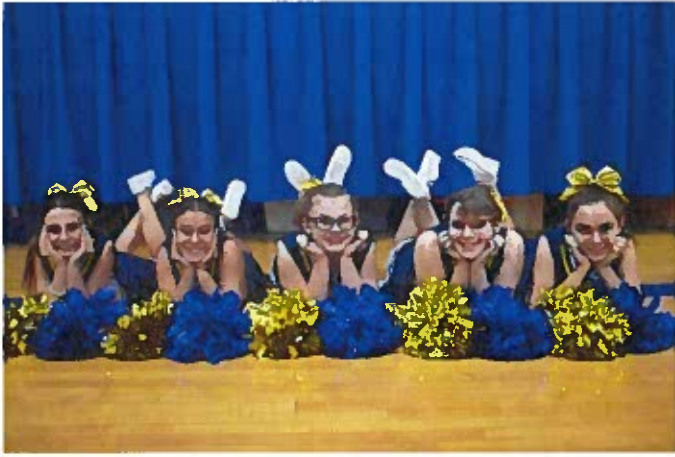
Middle school cheer posing for a picture.