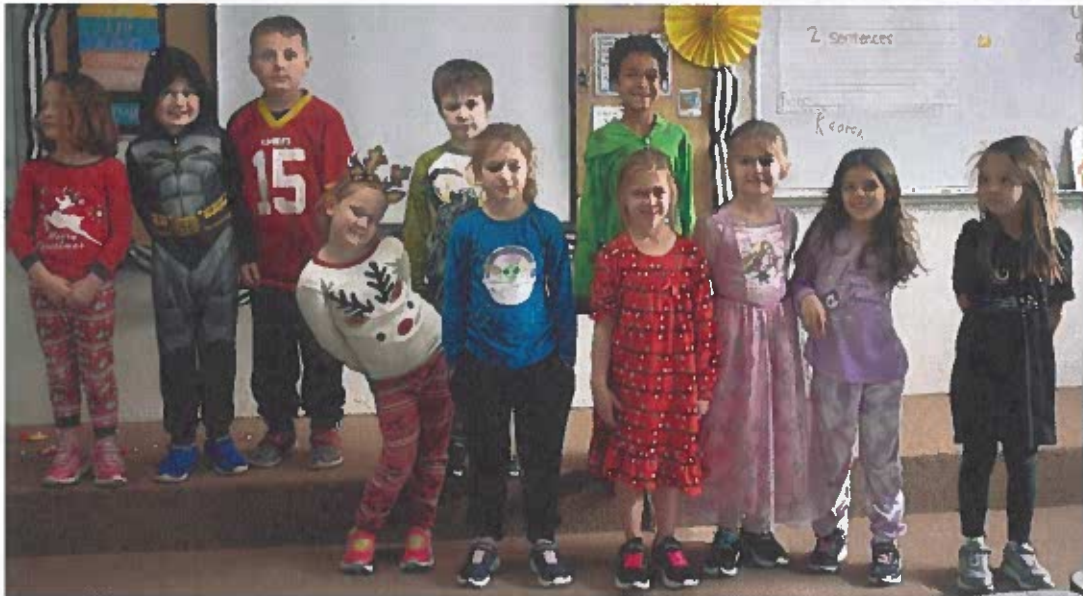
Saint Xavier 1st grade class showing off their pajamas on Pajama Day.