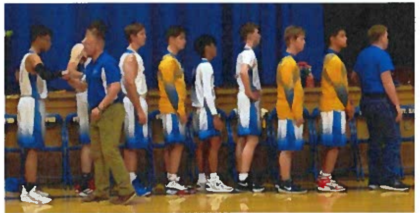
Getting ready to pray before the game.