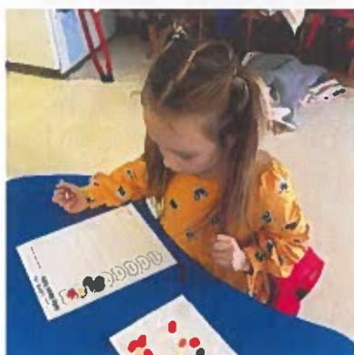
Learning using jellybeans.