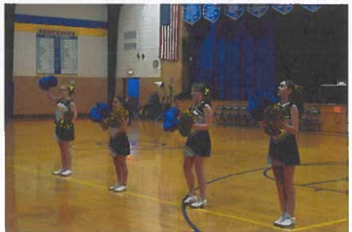
Middle school cheerleaders performing for the Pep Rally!