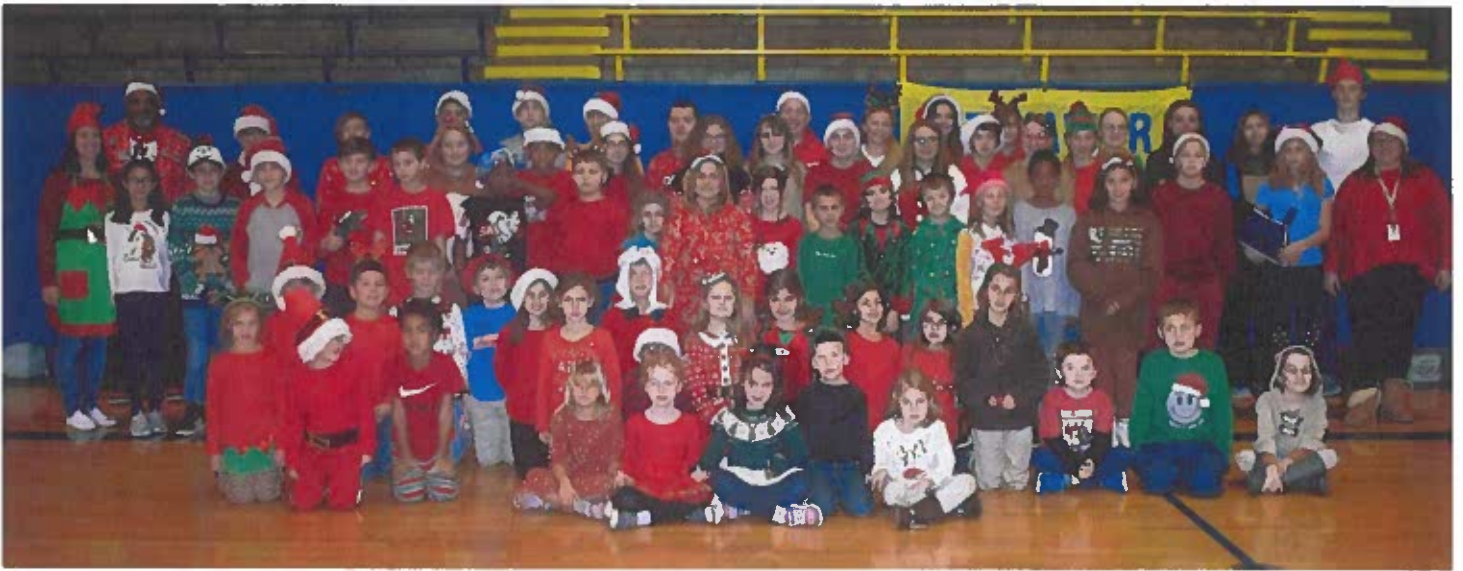
Saint Xavier students dressed up for Ugly Christmas Sweater Day.