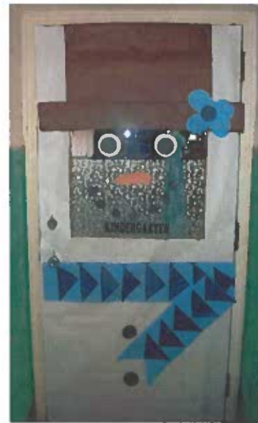
PreK decorated door!

EDUCATING FOR ETERNITY THROUGH FAITH & REASON