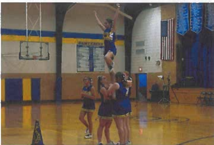
HS cheer doing a Liberty during the homecoming pep rally.