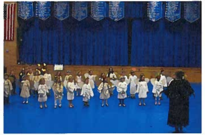
K thru 2nd grade angels for the elementary Christmas concert.