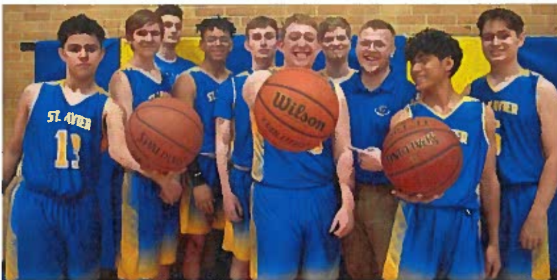
High school boys basketball team— part of our Ramily.