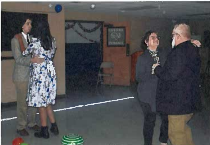
Saint Xavier Staff enjoying Homecoming.