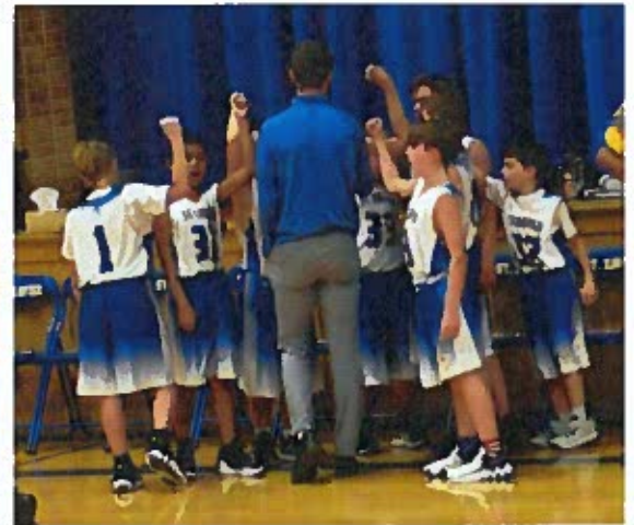
Middle school boys basketball discussing plays for the game.

“LORD, IT IS GOOD THAT WE ARE HERE” (MATTHEW 17:4)