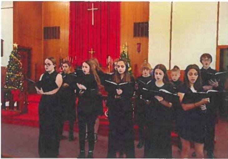
Saint X choir singing at a Lutheran service in Latimer, KS.