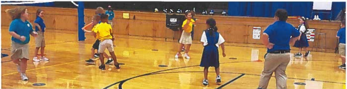
The PE classes are always challenged with new activities!