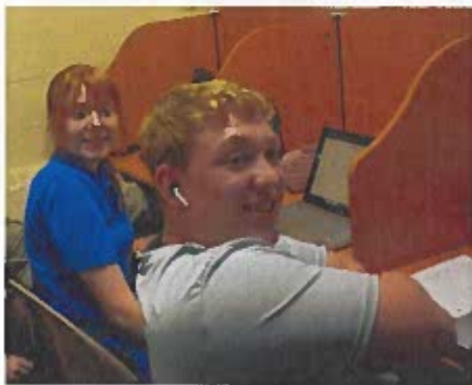
Seniors working on their college courses. Grade 2 sharing their love with Rowdy.