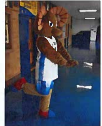
Rowdy the Ram strikes a pose.