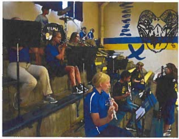
Band students playing at their first pep rally.