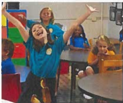
4th grade having fun in class.