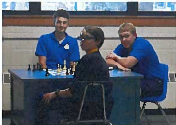
Want to play a game of chess?