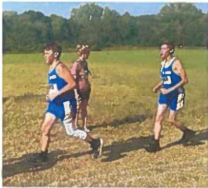
First cross country meet at Tescott.