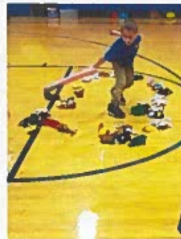
Learning is fun in PE class.