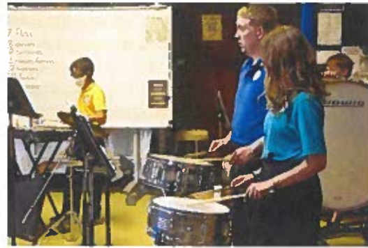
Percussionists playing new music.