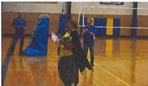
Award presentations at the Pep Rally.