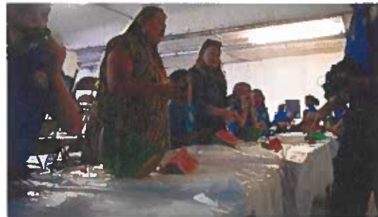
PreK – 6th at the watermelon challenge --a STREAM project.