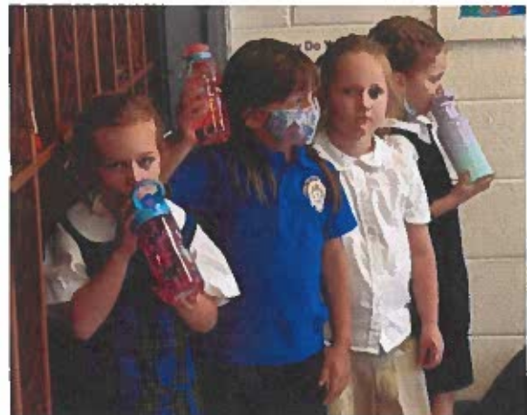
Kindergarteners taking a quick break!