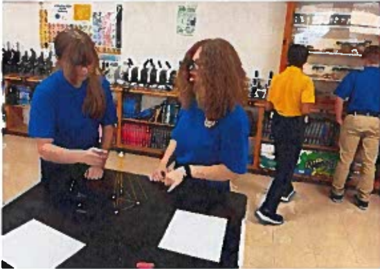
9 th Grade working on their project and inspecting the science lab.