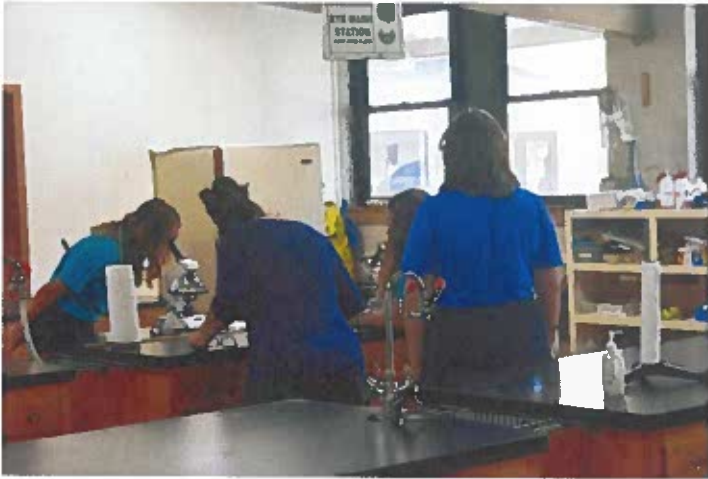
Anatomy students looking through the microscopes.