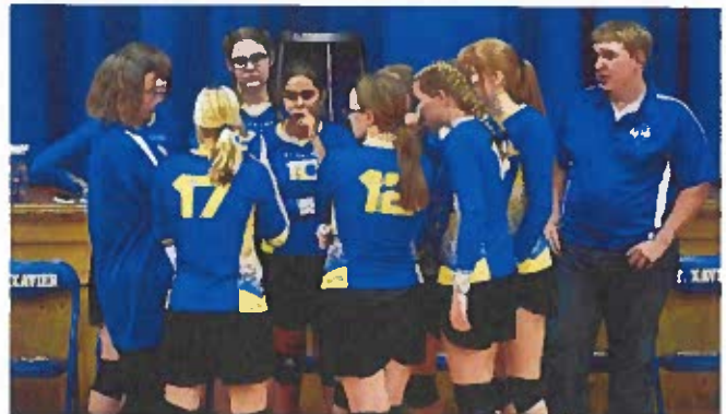
First high school volleyball game.