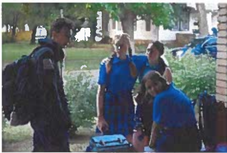
The members of our Ram family are ready for Day 1.