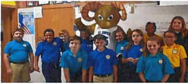
Rowdy the Ram with the 5th and 6th grades!